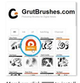
Members click www to install new brushes directly into Photoshop from the web!